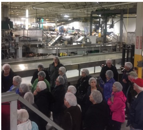
Touring the Algoma Orchards plant in December!

If you missed this last year, you will want to sign up for the Hotel California salute to the Eagles, April 13 th at the Newcastle Town Hall. $35 Price includes reserved seating and hors d'oeuvres. A Martini bar is available. For almost 3 decades Hotel California has been recreating the legendary sound of the Eagles.